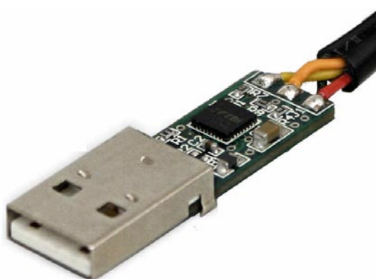
Figure 2 - Inside the USB 'A' connector on the TTL-232R-3V3.