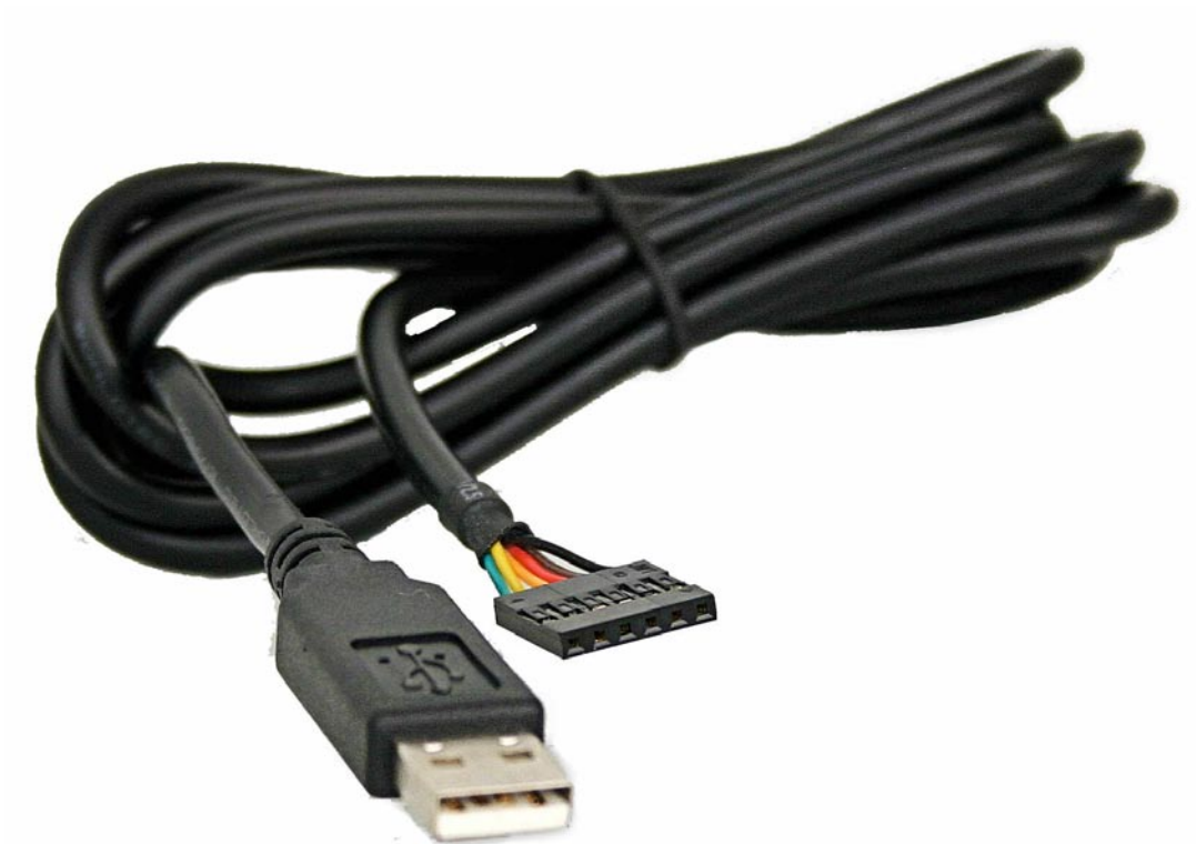
Figure 1 - The TTL-232R-3V3 USB to TTL Serial Converter Cable.